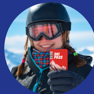
Expedite Access Control