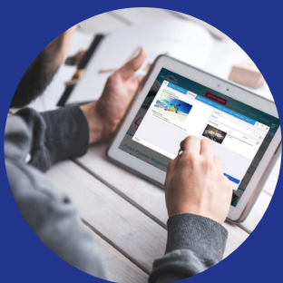
Simplify & Drive Sales